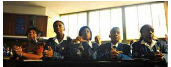
▲ CELEBRATING ST THOMAS 26 JANUARY, 2012

“Better to illuminate than merely to shine, to deliver to others contemplated truths than merely to contemplate.