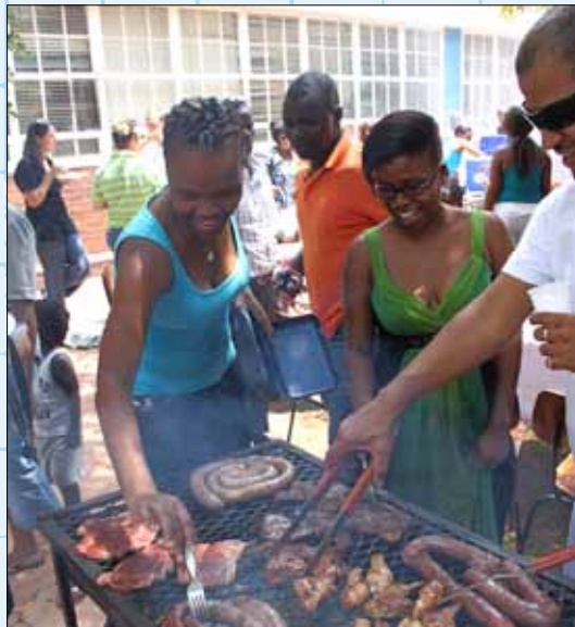
▲ SHISA NYAMA ▲ HIGH SCHOOL INFO SESSION (top right) ▲ ATHLETIC MORNING (bottom right)

Friday 3 February Grade 8 Pool Party Marimba Workshop